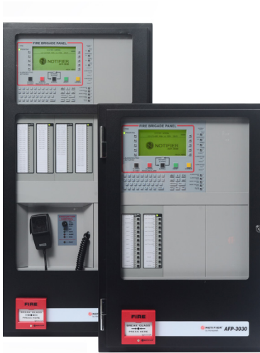
AFP-3030 in CAB-900 and CAB650